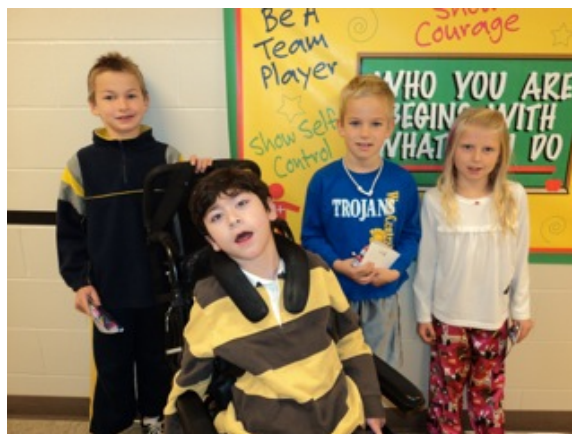
Second Grade November Birthdays